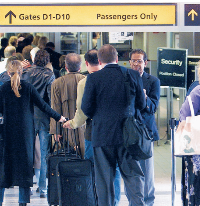
▲ Passengers wait to go through a security check at La Guardia Airport in New York.

President Bush signed an antiterrorism bill into law. The law, known as the USA Patriot Act , allowed the government to